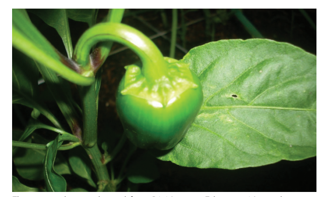
This material was adapted from PA Nutrition Education Network, www.panen.org.

This material was developed and provided by the UMass Extension Nutrition Education Program with funding from USDA'S Supplemental Nutrition Assistance Program. The Supplemental Nutrition Assistance Program helps low-income people buy the food they need for good health. It can help you to buy nutritious food and stretch your food dollars. For more information, call 1-866-950-3663.