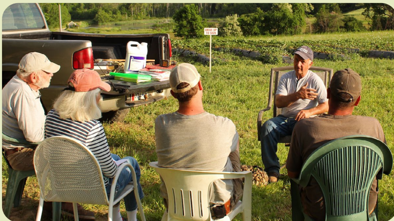
"Twilight Meeting" at Spring Rain Farm in Taunton, MA

Our organizations helped farms understand pandemic restrictions, access PPE, testing, and vaccinations, and adapt their sales channels to serve consumers directly.