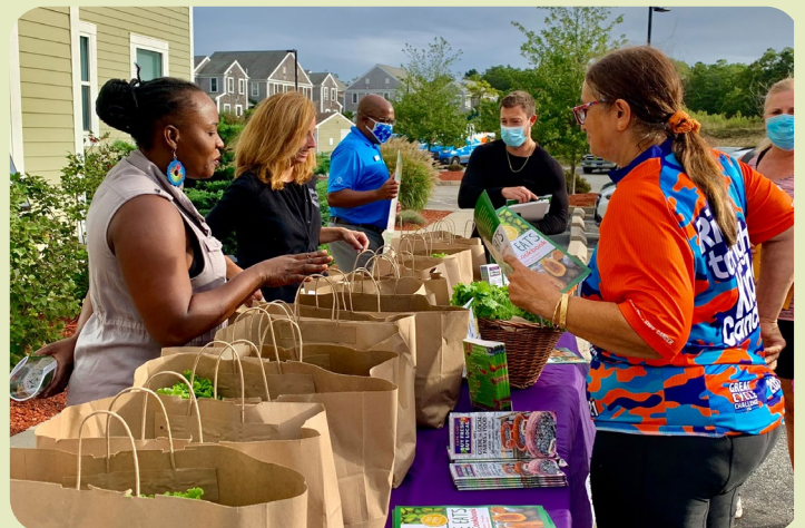
Distributing Local Food to Community Members

Together we helped people access local food through HIP and SNAP, supporting new HIP vendors so they could serve consumers, and educating service providers and SNAP clients about HIP availability and locations.